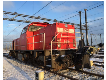
RILA sensors mounted on a track recording vehicle to acquire a 3D model of the railway corridor.