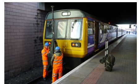
RILA track measurement system connects to almost any train in under two minutes.

RILA also reduces the environmental impact (energy and ecological), as the system is connected to regular trains combining rail measurements with scheduled train services.